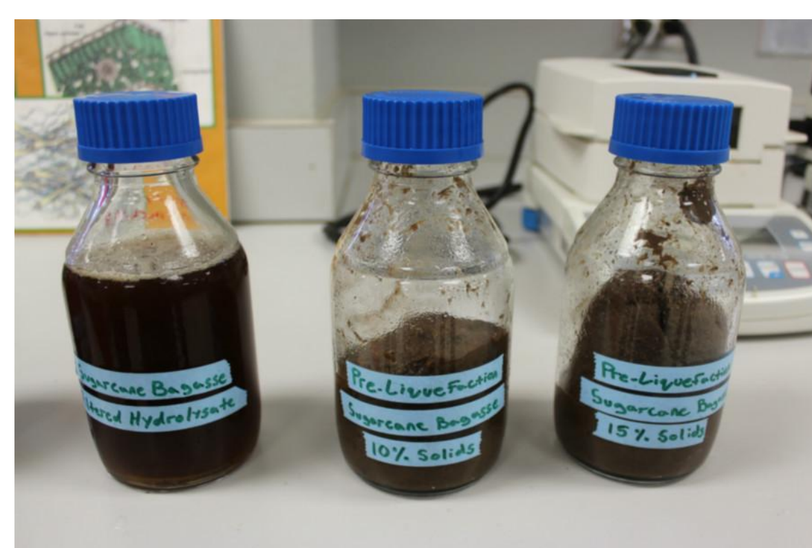
Figure 1. Bioethanol Residues from Perry Pilot Plant, FL. (from left to right): Filtrate, 10% Solids, 15% Solids